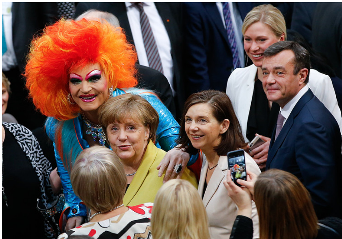
Greek bailout talks have often become a hostage to domestic politics when European leaders such as German Chancellor Angela Merkel need to win votes.