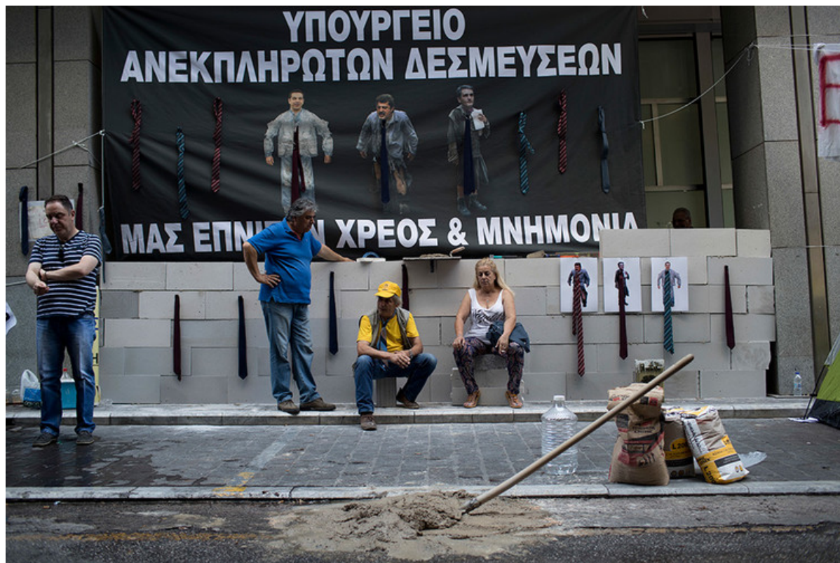
Protesting hospital staff sit in front of a wall they built in front of the Greek Finance Ministry with a banner depicting their leaders wearing ties that read ‘Ministry of broken promises’ and ‘We drown in debt and bailouts.’

And there’s a way to do that which makes the pain bearable for everyone and opens a path back to normalcy.