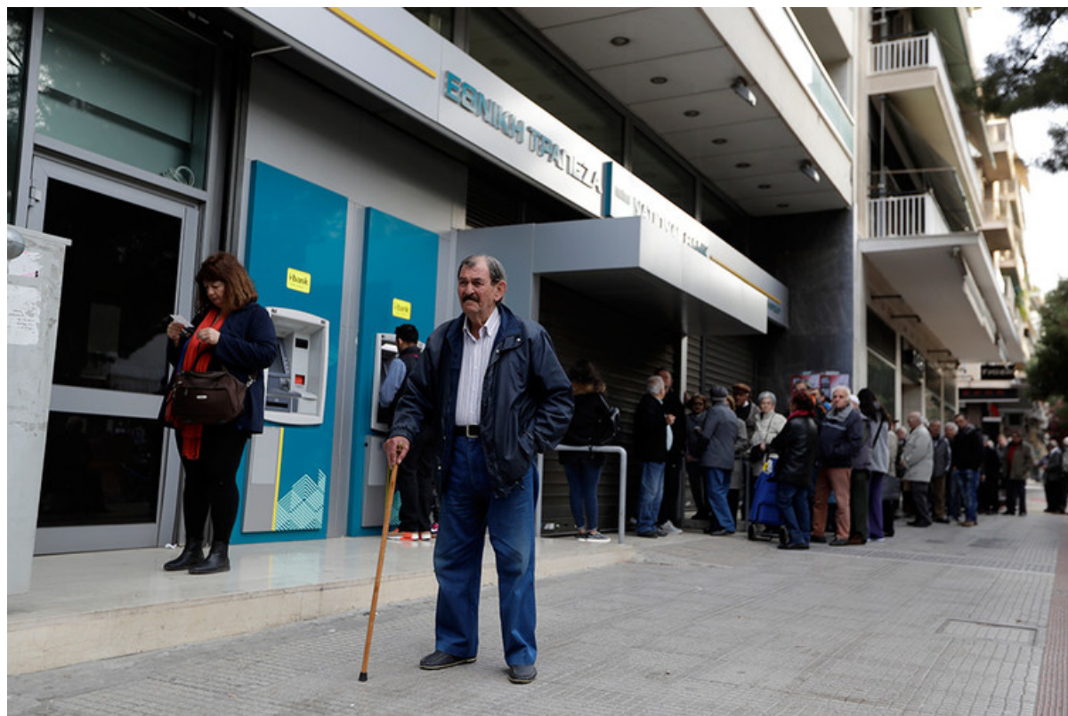
Retirees wait for a bank branch to open to receive their monthly pension payments.